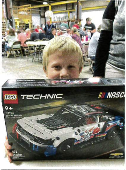
ota Espey pose with their prizes.