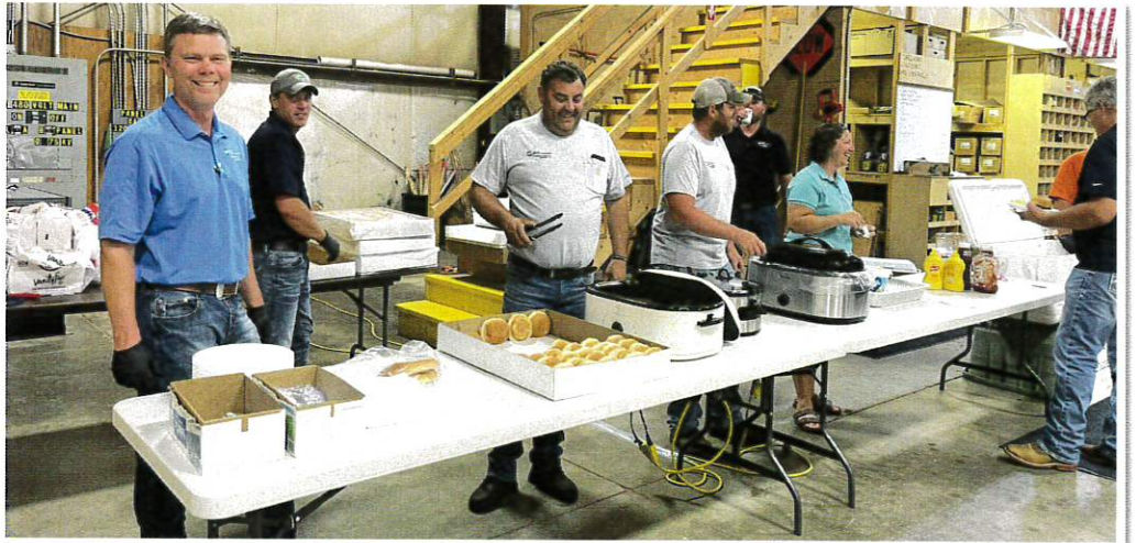
Directors served burgers, grilled by the Melvin 313 Club, with potato salad and baked beans.